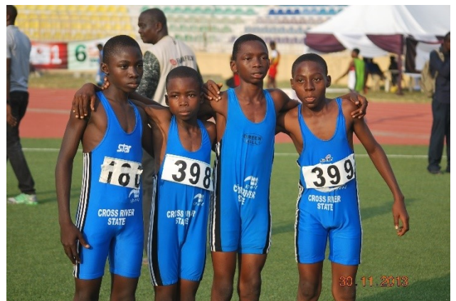
Gold Medal winning U-12 4x100 relay team, NSSF 2013 Ilorin.