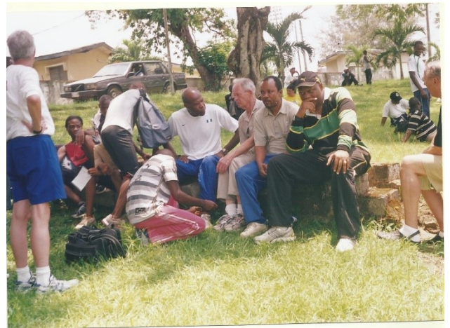
Coaches taking a break during workshop field demonstrations in Ikom.