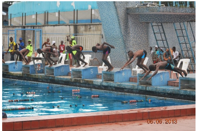
Boys U-15 starting their race at the 2013 State Swimming Championships, Calabar