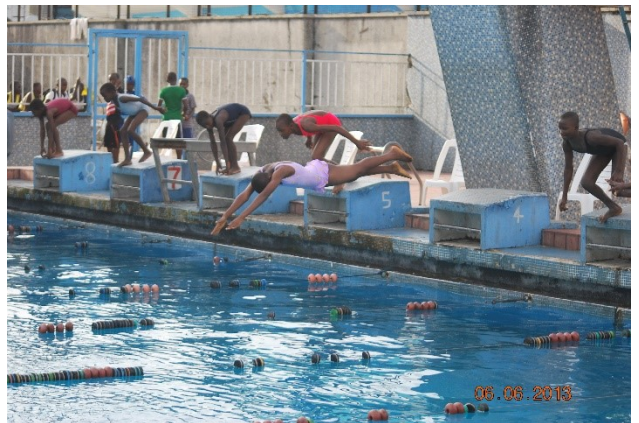
U-12 girls diving into the pool at the State Champs 2013.