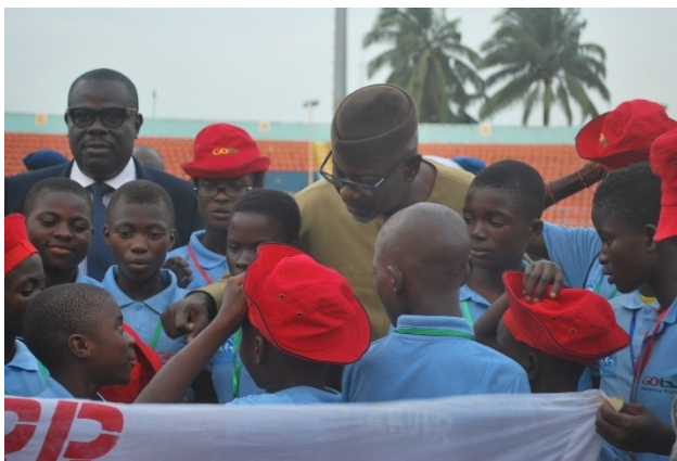
His Excellency Gov. Imoke chatting with young athletes at the opening ceremony of state Champs 2014.