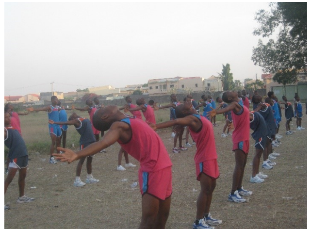
CRS athletes stretching before their training during the NSSF 2010 championship in Kano.