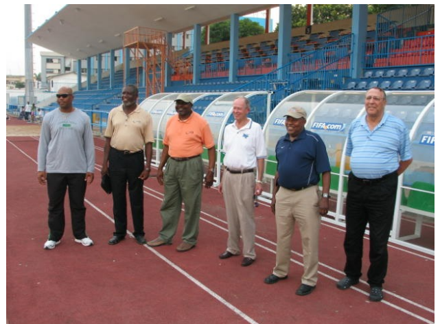
The foreign coaches and technical experts at the U.J. Esuene stadium, calabar during workshop, training and seminar sessions