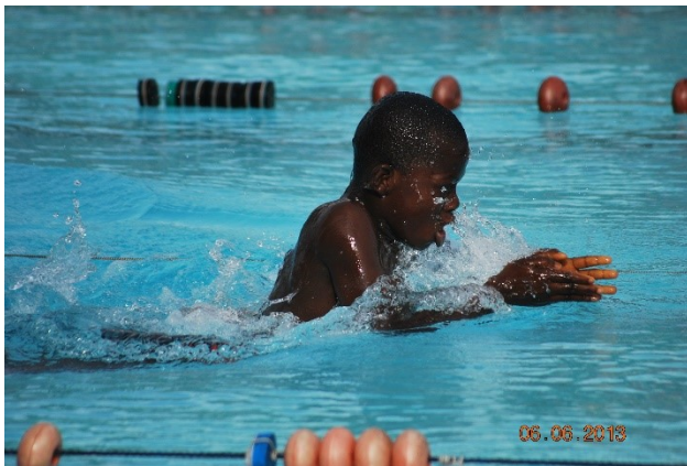
U-12 swimmer in the pool during state champs 2012, in Calabar.