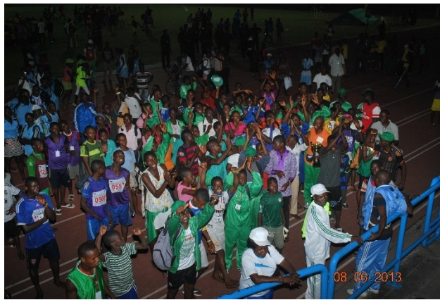
Athletes and officials waiting to hear the results of the 2013 State Championship at the U.J. Esuene Stadium in Calabar