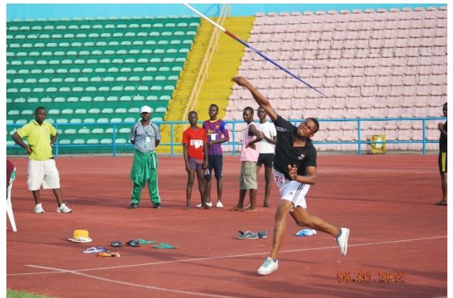
U-15 Javelin thrower at the 2014 state Championships in Calabar.