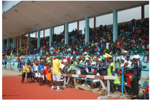
Cross section of the crowd at the 2014 state championship, U. J. Esuene Stadium, Calabar.