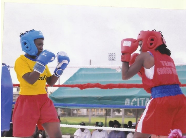
CRS Female boxers in action during inter-state championships, 2012.