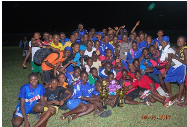
Ikom LGA team celebrating their victory in 2013 state championships.