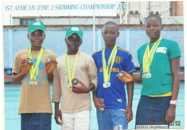
4 CRS swimmers won 14 gold medals for Nigeria at the 1 st Africa Zone 2 Swimming Championship.