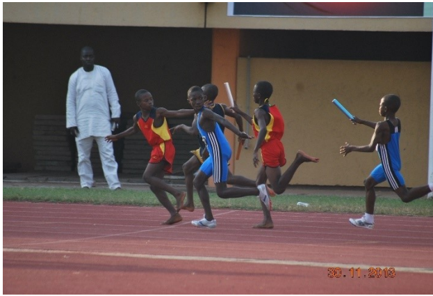
CRS U-12 4x100 relay baton exchange NSSF 2013 Displaying professional skills at a young age.