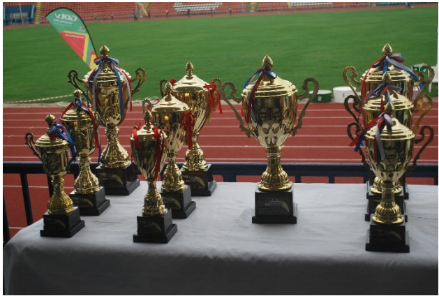
Trophies displayed at the 2013 State Championships.