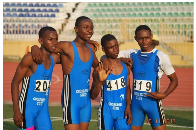
U-15 Gold Medal winning 4x100 relay team, NSSF 2013, Ilorin.