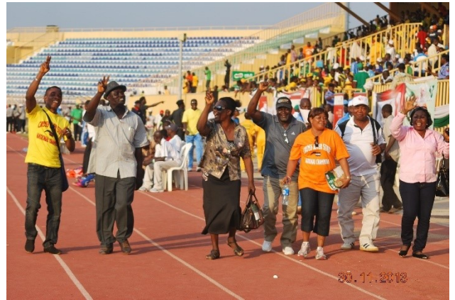
CRS Coaches and Officials Celebrating NSSF 2013 National Championship Victory, in Ilorin.