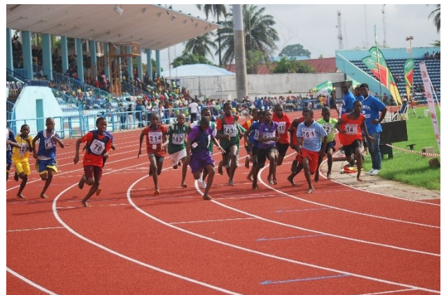
U-12 boys starting the 800 meters during the 2014 State championship in Calabar.