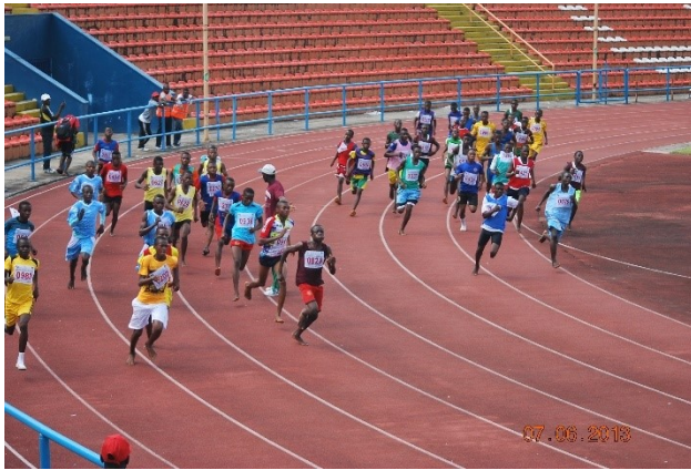
CRS U-15 boys running the 800 meters during the state champs 2013.