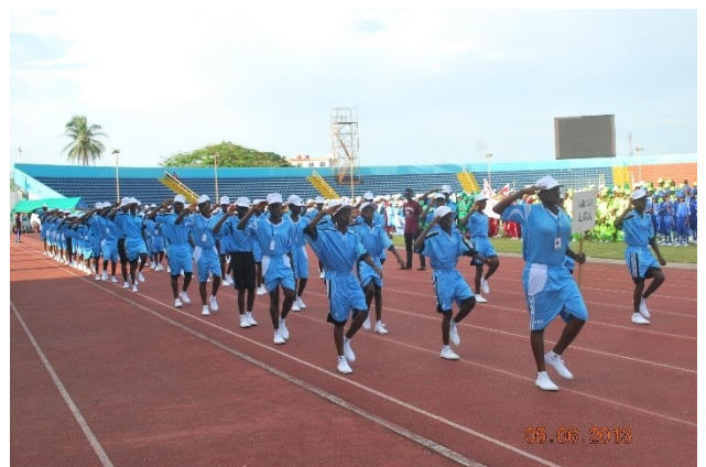
Boki Local Government team marching past at the 2013 State Champs in Calabar.