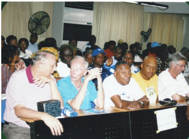
Foreign Coaches at the opening ceremony of the CSDP, State Library, Calabar, May 2010