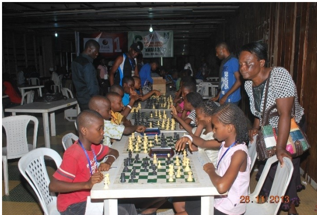
CRS U-12 Chess team performing, NSSF 2013