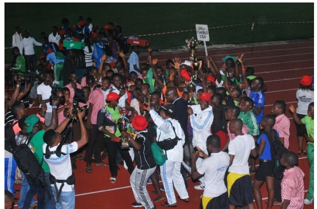
Overall winning LGA celebrating with their trophies 2014 State Champs Calabar.