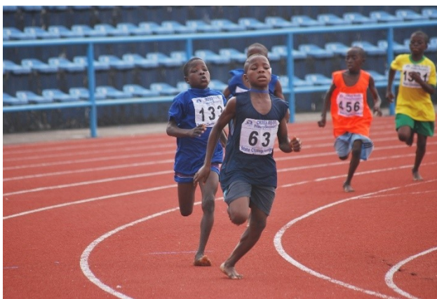
U-12 Boys strategy and determination