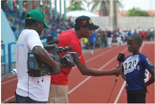
U-12 race winner handling the press like a professional at the 2014 state championship.