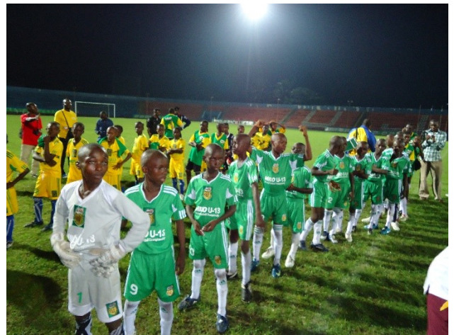
U-12 Football Final at the NSSF 2011 in Calabar