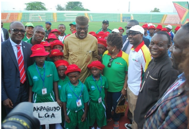
Gov. Imoke posing for a picture with Team Akpabuyo, opening ceremony 2014 State Champs